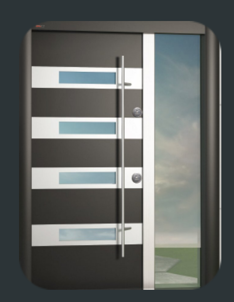
SNY UV 103 Diana Double - UV Anthracite