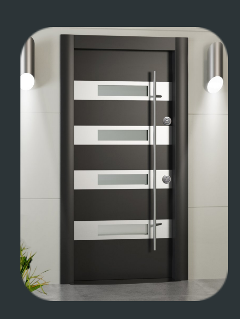
SNY UV 103 Diana - UV Anthracite